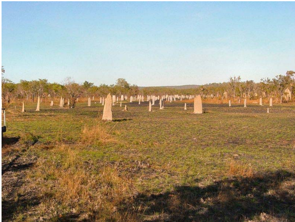
A field of mounds also in Australia