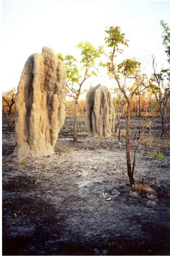
More cathedral mounds in Northern Africa

So, you know that if you have mud tubes present around your foundation or even on your walls, chances are very good that you have termites. But what else should you look for when trying to determine if you have termites?