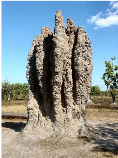
Cathedral Mounds in Australia

In some places of the world, termite mud tubes are quite large and amazing structures. Check out some of these gigantic mud tubes: